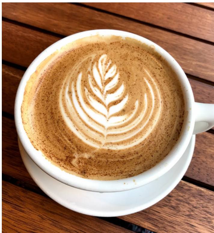
Latte @ Cafe Astoria