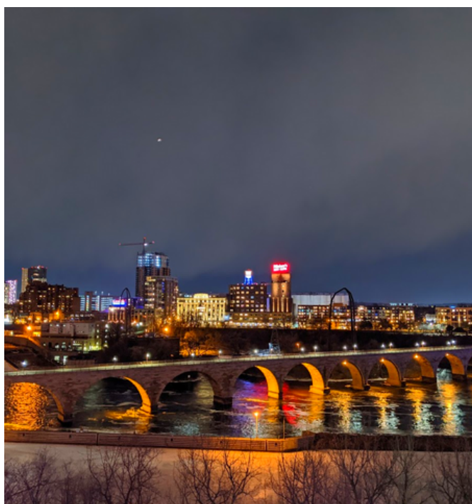
Skyline view from Guthrie Theater