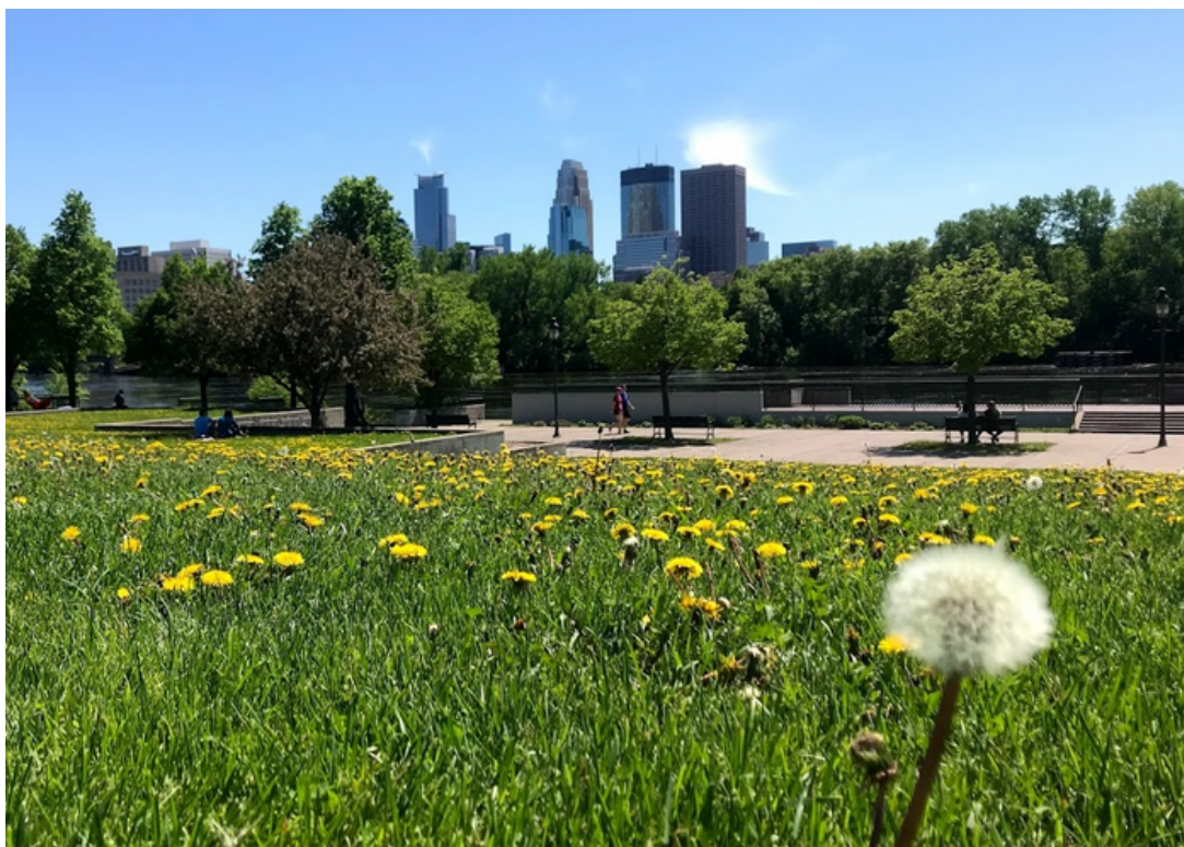
Boom Island Park