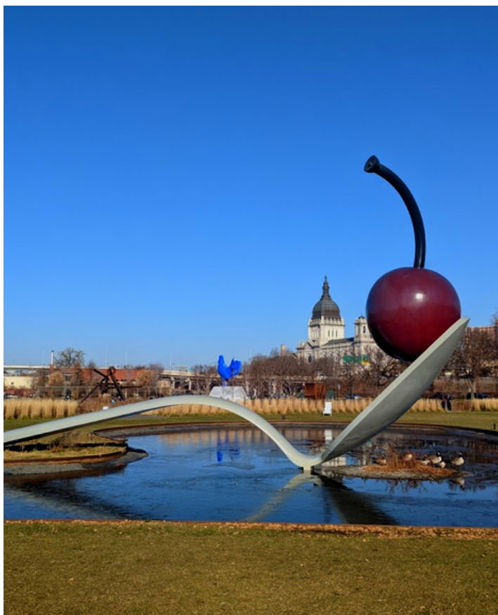
Sculpture Garden Minneapolis